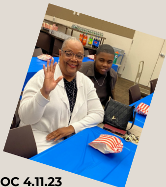
Family Movie Night at the BEOC 4.11.23