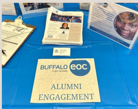
Alumni Information at Student Support Services Open Houses